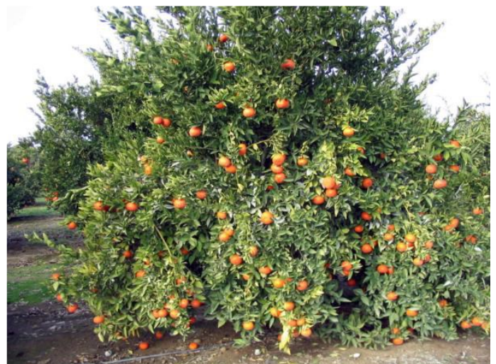
Yosemite Gold tree showing a more orange like open structure and good crop of large sized fruit.

Experimental - Yosemite Gold is currently under evaluation by Citrus Research International and sufficient quantities of budwood are available from the Citrus Foundation Block.