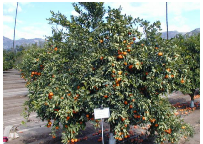
Tahoe Gold tree showing a more orange like open structure and good crop of medium sized fruit.

Experimental - Tahoe Gold is currently under evaluation by Citrus Research International and only limited quantities are available from the Citrus Foundation Block.