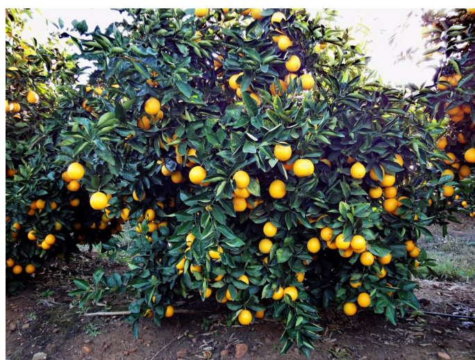
Four year old Midnight tree on Carrizo citrange showing typical shape and yield (tree height 2m).

The Midnight does not require crop manipulation in the cold areas, but in the warm areas GA sprays or girdling are required to ensure acceptable fruit set. It is not susceptible to any pests and/or diseases other than those common to other Valencia selections. Harvest, packing and shipping requirements as well as post harvest disorders are as for other Valencias.