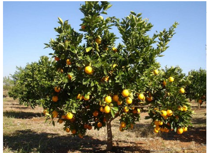
Three year old Henrietta tree showing typical spreading growth and good production of large fruit (tree height 2m).

Experimental - suitable Valencia areas. Sufficient quantities of propagation material are available from the Citrus Foundation Block.